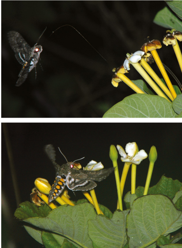
Fig. 1. Morphological mismatches set important biological constraints for size-limited foragers, including predators, pollinators and frugivores. In plant–animal mutualisms (e.g. plant–pollinator interactions), a morphological mismatch between partners sets size limits that filter out a range of phenotypes that otherwise could eventually interact. Two main co-evolutionary trends in hawkmoth–flower interactions involve arms-race trends (with progressively longer spurs and probosces) and pollinator shifts (where short-tongued moths are replaced as legitimate pollinators by long-tongued species when corolla tubes increase in length). In many cases, pollination is impossible when the proboscis is longer than the spurs because the pollen or pollinaria are attached further from the base of the proboscis. When this happens, the pollen or pollinaria may be scratched away by the forelegs when the proboscis is rolled to a loose spiral; yet in other cases, actual pollen transfer may occur when long-tongued moths visit short-tubed flowers. If the proboscis is shorter than the spur, transfer of the pollen or pollinaria is possible as long as the proboscis can get in contact with the sexual organs of the flowers. Other reasons for forbidden links include phenological differences (Bascompte & Jordano 2014). Thus, a number of the potential interactions that could take place in a given mutualistic assemblage simply cannot occur because of biological reasons: these are forbidden interactions. Photograph: A sphingid moth, Manduca sexta visiting a flower of Tocoyena formosa (Rubiaceae) in the Brazilian Cerrado; tongue and corolla tube lengths approximately 100 mm. Top, approaching and probing a flower; bottom, extracting nectar.

There is a Madagascar Orchis—the Angraecum sesquipedale —with an immensely long and deep nectary. How did such an extraordinary organ come to be developed? Mr. Darwin's [p. 475] explanation is this. The pollen of this flower can only be removed